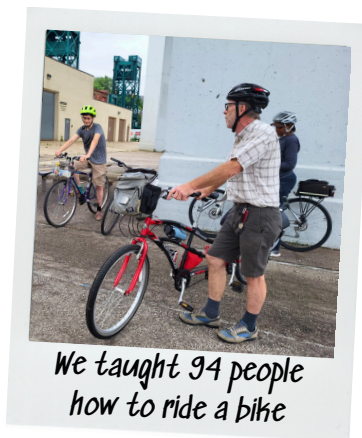
We taught 94 people how to ride a bike

The Ohio City Bicycle Co-op (OCBC) is a volunteer-driven, non-profit bicycle education center that offers riding and repair classes, community programs, a well-equipped community shop where individuals can repair their own bikes, and a bicycle thrift store for refurbished bikes and used bike parts and gear.