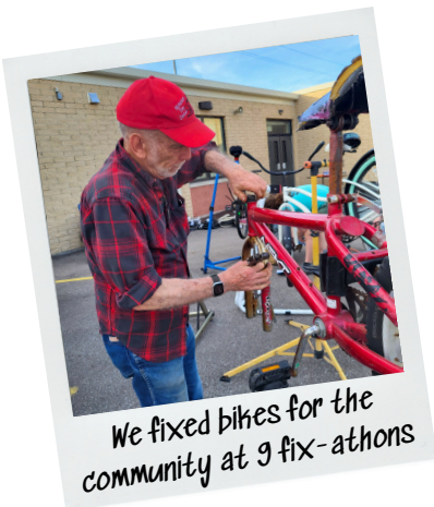
We fixed bikes for the community at 9 fix-a-thons