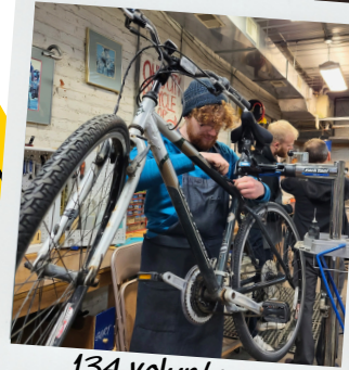
134 volunteers contributed 4,894 hours

9 people learned how to build a bike wheel